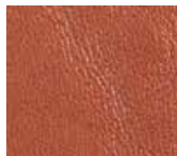
Autumn Leaf 523155