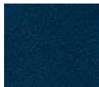
Colonial Blue 519251